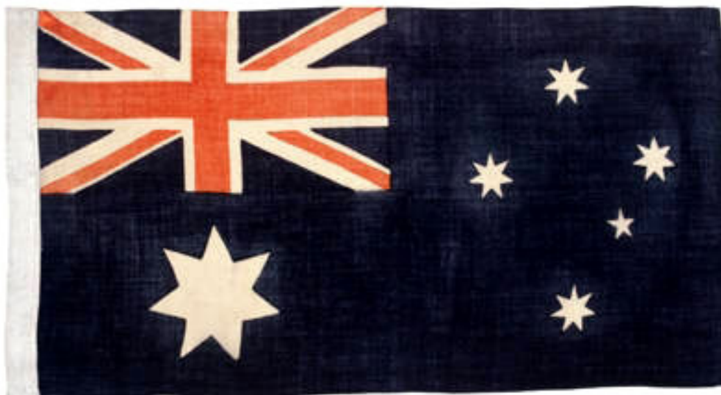
AWM Access Number: RELAWM15057

Used by the World War I Commander of Australian Imperial Forces on the Western Front in Europe, Lieutenant General, Sir John Monash, between June–November 1918. This was Monash's personal command flag, and is the only known example of the Australian blue ensign being officially used by the Australian Army on a permanent basis during World War I, other than occasional use on parades.