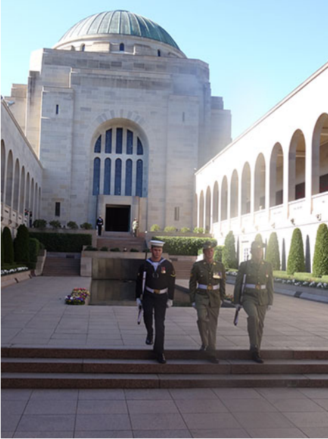
AWM Memorial Courtyard

After visiting the Annex, participants travelled to the main Australian War Memorial (AWM). Lunch was provided in the Western Courtyard on arrival and participants then viewed the public areas of the AWM in small groups or individually. The AWM is both a war memorial and a large military history museum. The museum is arranged by the conflicts in which Australians have served. There are a number of flags in the First World War gallery and flags are also located in the other galleries. The AWM does not glorify warfare, but acknowledges the contribution of Australian soldiers, sailors and airmen and educates the public about the conflicts they engaged in. 2015 was significant as it was the centenary of the Gallipoli landing by the ANZACs. Some photos taken on the day: