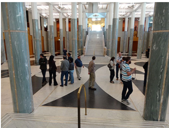
ICV participants in foyer