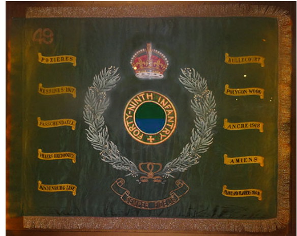
Regimental Colour 49 th Infantry Battalion