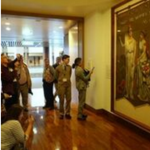
Congress participants inspecting the "Trust the Women" Suffrage Banner of 1908, in Parliament House. Banner's photo is sourced from the Australian Parliament's "Visit Parliament" website.

The Banner was purchased in England by the Australian Bicentennial Authority and was in 1988 presented to Senator Margaret Reynolds, Minister Assisting the Prime Minister for the Status of Women, by the Australian Council of Women. In 2002 it was donated to the Parliament House for permanent display to celebrate the centenary of the Commonwealth Franchise Act (1902).