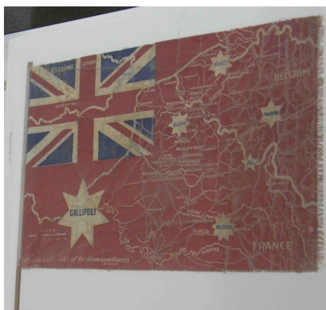
“Famous battlefields of the Australian Forces” AWM Access Number - RELAWM21154 Overall (flag only): 260 mm height x 425 mm width