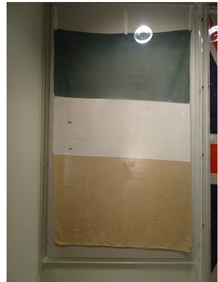
Boer flag captured by British troops on 4 April 1900 at Boshof, South African Republic