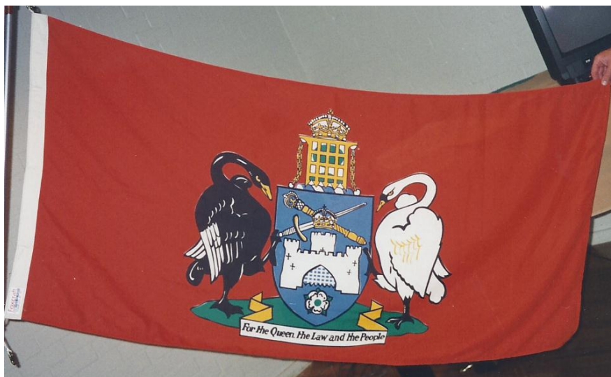
City of Canberra Flag 1958–93

The amended flag was used until 25 March 1993.