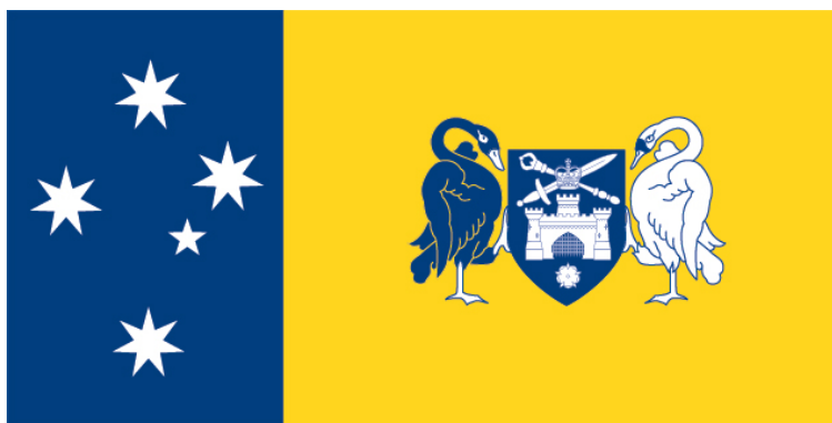
Australian Capital Territory Flag – Graphics: Ralph Kelly (Flags Australia)

On 11 May 1989 self-government started in the Australian Capital Territory with the first sitting of the Legislative Assembly. This event reignited earlier attempts to design and adopt a distinctive flag for the ACT. Prior to self-government, between October 1984 and May 1985, the then ACT House of Assembly held a competition to design a flag for use by the Assembly itself. Despite declaring a winning design, this flag was never adopted by the ACT House of Assembly. 11 Further competitions were held in 1988 and 1992.