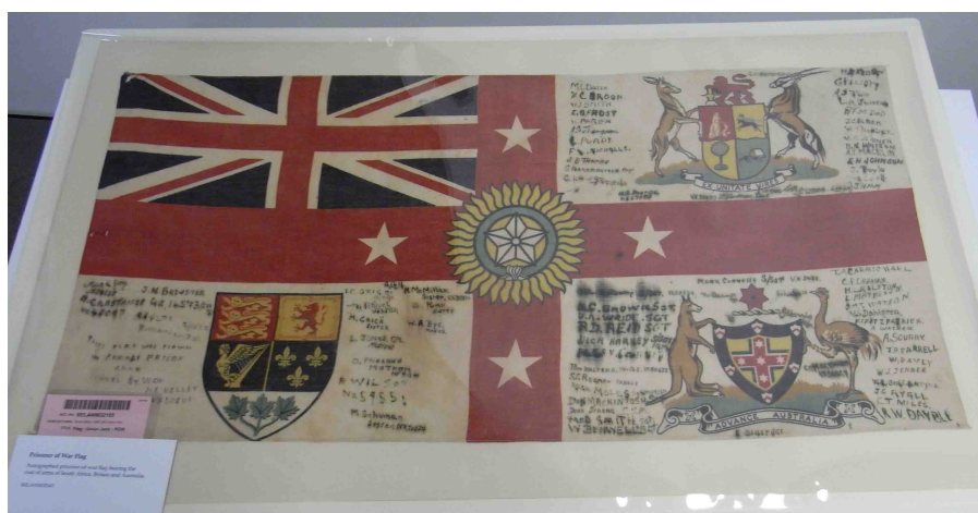
AWM Access Number: RELAWM32165