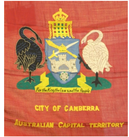
Commemorative “City–Territory” Ceremonial Flag – 1938 or 1952