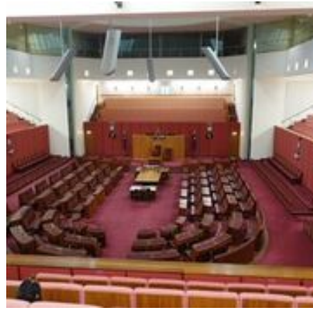
Senate chamber