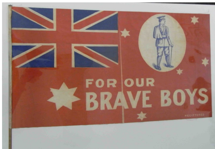
Patriotic Australian Red Ensign

AWM Access Number - RELAWM48890 Overall (flag only): 178 mm height x 245 mm width