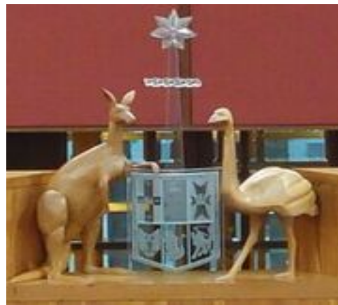
Photo: Senate display of the Australian Coat-of-Arms.