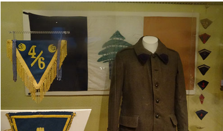
French Lebanon and trumpet pennant. 1940-41