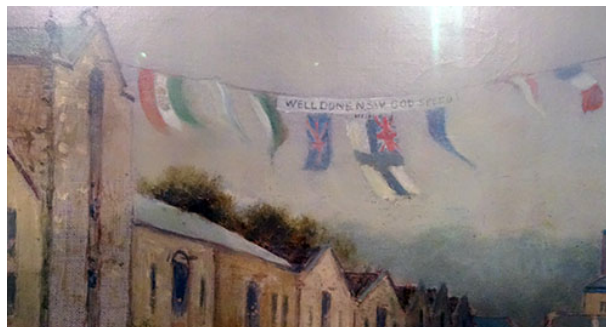
Detail from The departure of the Australian contingent to the Sudan, 1885 by A. Collingridge