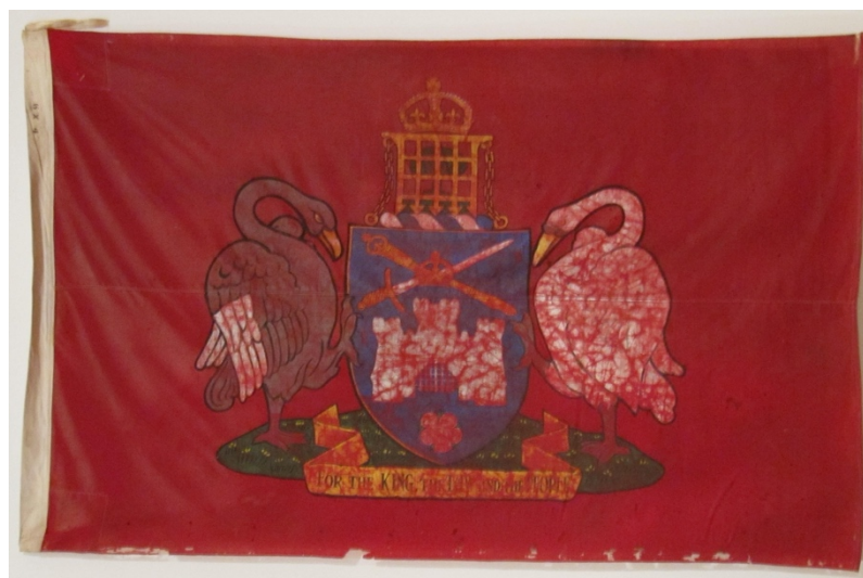
Federal Capital Commission Flag 1929 – 58

A version of this flag with a blue field was also made, but was never officially used. 8