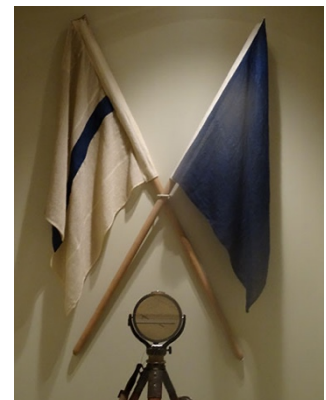
Semaphore flags & heliograph