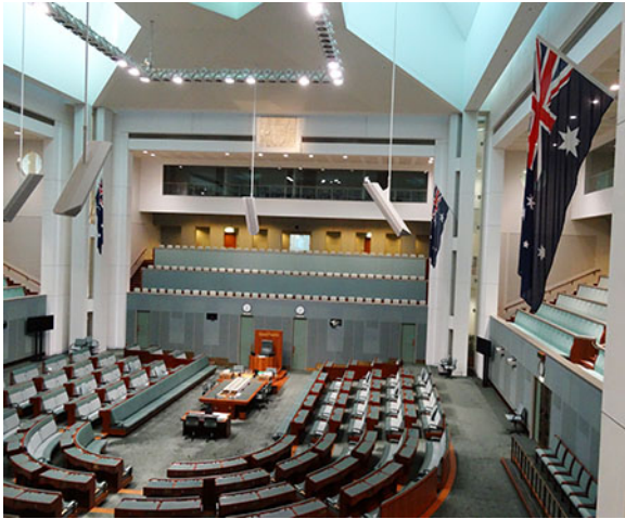
House of Representatives