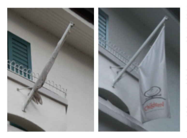
Figure 60 : Unidentified flag, Oberföhringer Str. 4, photographed 13 April 2015.

Even then it was not always possible to take a decent photograph of each and every flag, especially if the flag was not fully extended. Sometimes this even precluded identification of the flag; Fig. 60 is one example – the white flag could only be identified on a later date, when it was fully extended ( Fig. 61 ).