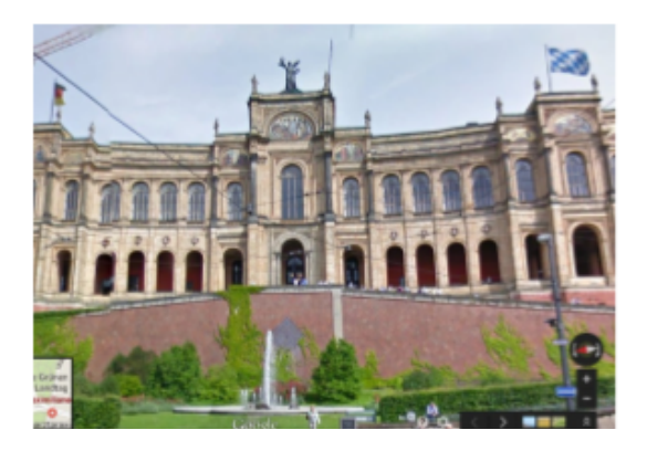
Figure 52 : State parliament ( Landtag ) in 2008, seen the west (Bavarian flag above the south wing).