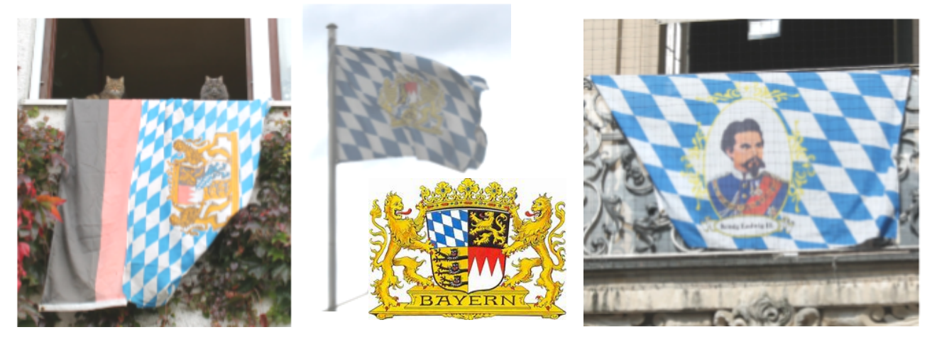
Figure 11: Private display of Bavarian and German flag, from a window.

Two typical private kinds of display are shown in Figures 11 and 12 : a flag hanging from a window or balcony, and a flag flying from a flagstaff in an allotment garden. In many cases, this is an unofficial and (in a strict sense) even illegal <sup>6</sup> flag, namely a lozengy flag with the Greater State Arms.<sup>7</sup> Another, less frequent version shows an effigy of Bavarian King Ludwig II. (18451886) on the lozengy field ( Fig. 13 ); this particular flag was displayed several days before the CSD parade, adjacent to several LGBT rainbow flags; Ludwig II., widely assumed to be homosexual, can be thus viewed as a kind of Bavarian gay poster boy.