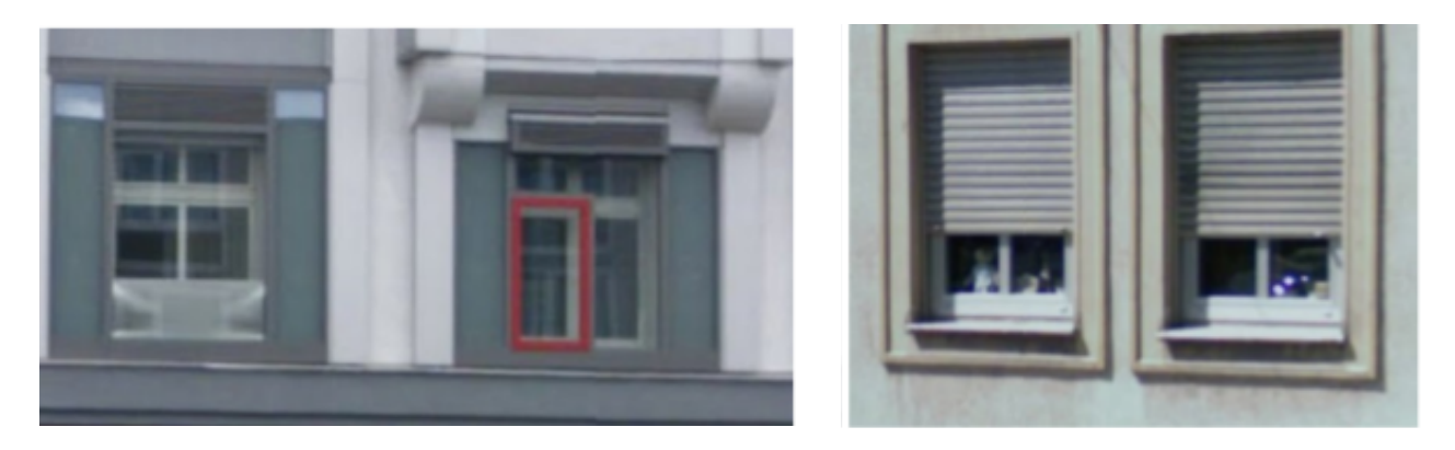
Figure 58: Window with Schwusos flag in Berg-am-LaimStraße was empty in 2008.

Figure 59 : Window with several US state flags possibly showing them already in 2008