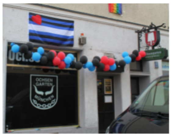
Figure 48: Leather Pride flag and balloons in its colours, on Ochsengarten pub, 11 July 2015, during CSD parade.

But also, other, less obvious, events might influence shorttime display of flags. For instance, there had been a large demonstration against the G7 summit on 4 June 2015, and a week later one of the massively evident anti-TTIP flags was displayed from a window ( Fig. 49 ).