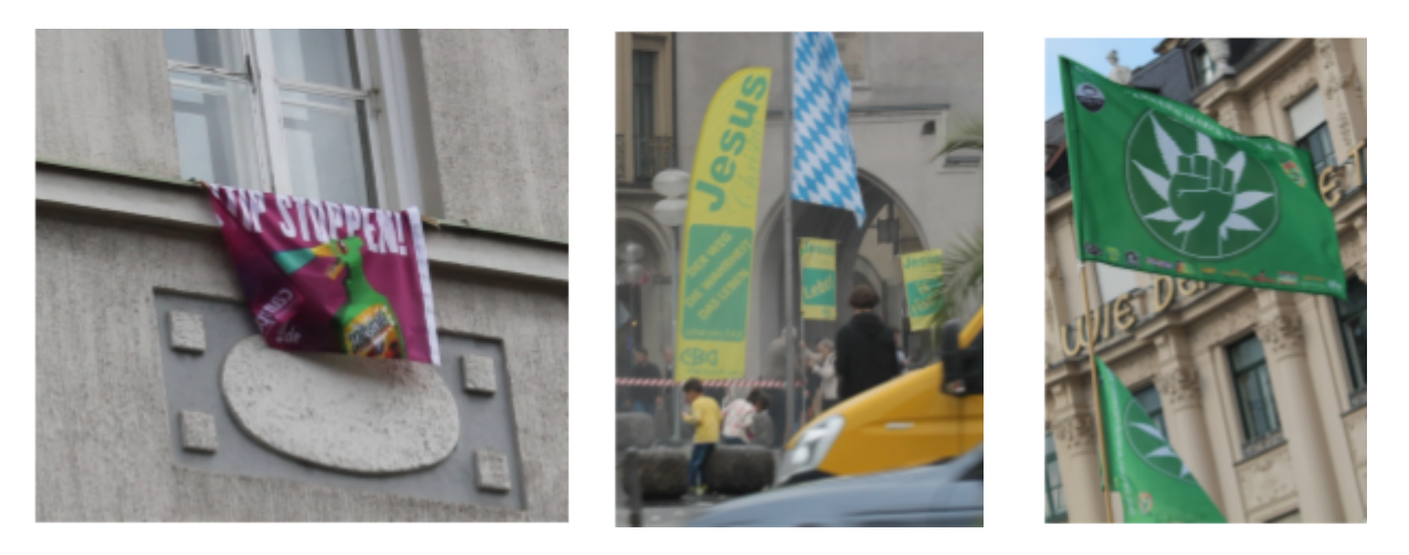
Figure 49: Anti-TTIP flag from Campact displayed from window, 11 June 2015

Along the tram-lines there are also several places where demonstrations or other events regularly occur, for instance the Karlsplatz (Stachus). Some flags appeared just for a day or less - for example, the different flags shown by the Evangelical CBG ( Christliche Brasilianische or Christian Brazilian Congregation) on 10 June 2015 ( Fig. 50 ). A day later, a campaign for legalizing Gemeinde cannabis products displayed several Cannabis March flags ( Fig. 51 ).