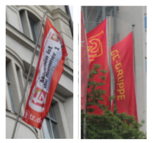
Figure 63: Flags of Gienger Group, that were not fully extended on 11 April 2015, now photographed from tram on 10 June 2015.

Figure 62: Flag of TZ newspaper on Bayerstr., corner of PaulHeyse Str. (10 June 2015), not seen on date of earlier mapping (11 April 2015).