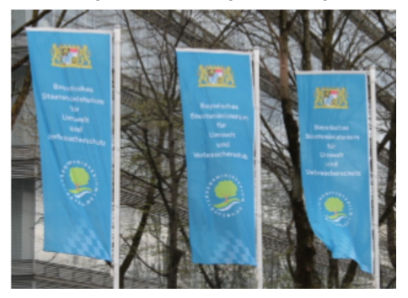
Figure 7: Logo flags displayed on the north-west side of the Ministry for the Environment.

In recent times, several of the Ministries have adopted logos that are, at least in some cases, also used on specific flags. One example is the logo flag of the Ministry for Environment and Consumer Protection ( Bayerisches Staatsministerium für Umwelt und Verbraucherschutz ), that shows (from top) the Greater State Arms, the Ministry name, the Ministry logo and some allusion to the Bavarian lozenges, all on a Bavarian blue field ( Fig. 7 ); another example is the flag of the Ministry for Health ( Fig. 41 ). As with all logo flags, these have no legal basis and might be changed from time to time.