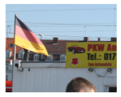
Figure 15: German flags flown by used-car dealer.