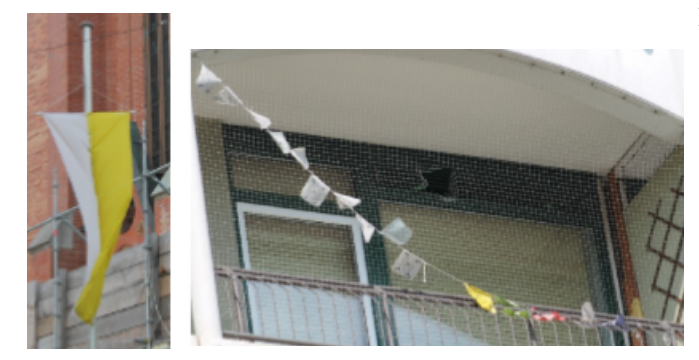
Figure 30: Catholic church flag in front of St. Johannes Kirche.

Figure 31: Buddhist prayer flags on a balcony.