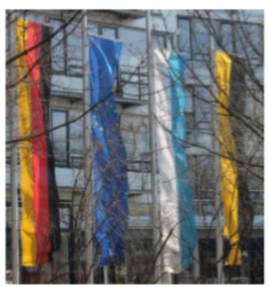
Figure 8: Flags at halfstaff, in front of the Technisches Rathaus . 28 March 2015

Figure 7: Logo flags displayed on the north-west side of the Ministry for the Environment.