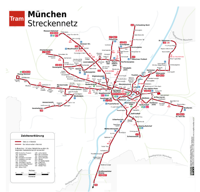
Figure 1: Tram lines in Munich, used as transects for the flag mapping; to the same scale as adjacent map